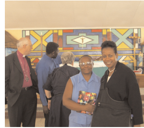
Members of the TEAC working party, meeting in South Africa, in discussion and visiting HIV/AIDS projects sponsored by the local Anglican Church

college is free to spend time on Anglican models of mission, just as Pentecostals, Methodists, Catholics, and others can emphasise their own historical and theological models – as long as they fulfil the requirements of the range statements and assessment criteria. The important thing is that students gain the competencies – the combination of knowledge, skills, and values – that they need in order to achieve the outcomes.